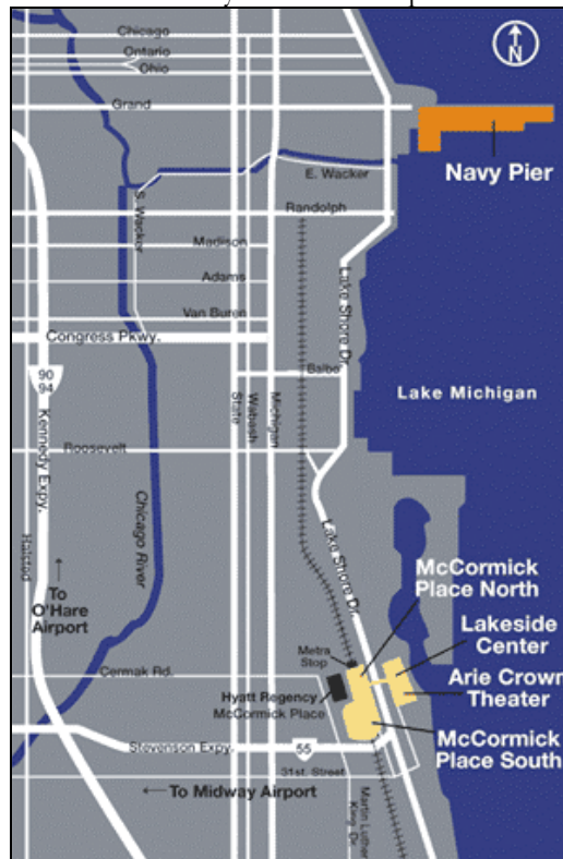
FIGURE 1: Navy Pier Area Map

to Rouse Company—any additional profits would be split evenly (Ziemba, 1982).